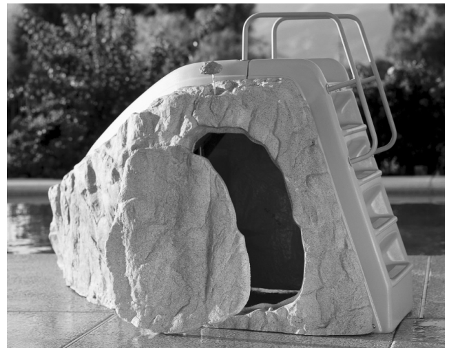
Slide Rock™ Footprint for RIGHT Turn Only Slide

"Slide Rock™" (4' @ Seat) Right Turn Only On Deck Installation Only